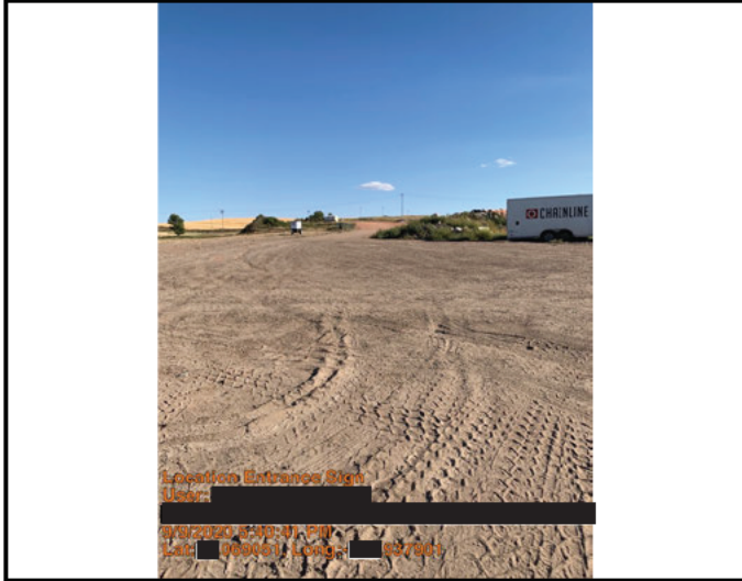
Take a Photo of the Location Entrance Sign