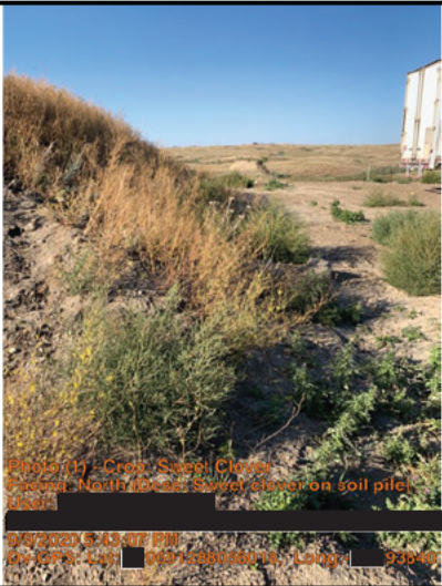
Crop Photo - 1